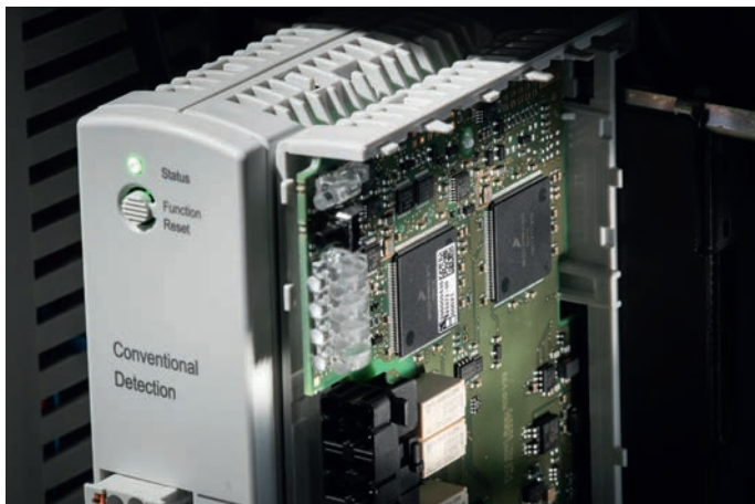
Clunid FMZ6000 redundant function module

Still not enough though. The newly integrated LogicManager prevents errors by plausibility checks right from configuration and thus increases the dependability of the total system.