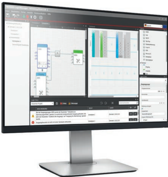
Clunid FMZ6000 LogicManager

LogicManager is the configuration software for the Clunid FMZ6000. This is constructed on the component concept and consistently separates logic and hardware. For example it is possible to change between loop and limit value functions at any time without having to restart the configuration. This offers flexibility and reduces project overhead. Moreover LogicManager has a fully implemented redo and undo design and numerous logic modules with extra features.